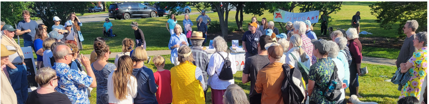
Community Opening Event, Carousel Cosmos