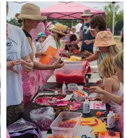
Beneath the Forest, Beneath the Trees poetry reading, art making workshop, Catalyst Fundraiser