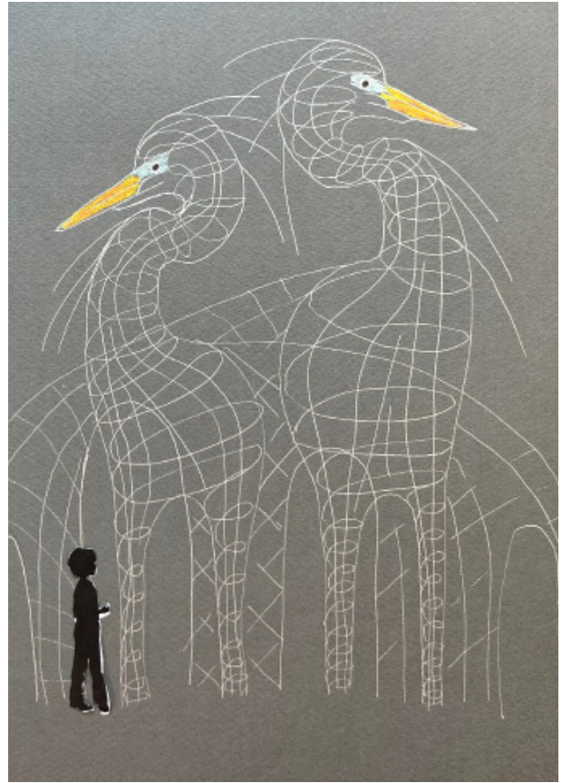
Dancing for Joy rendering, The Myth Makers

Project Sponsors will be featured in marketing materials, receive four complimentary tickets to our Catalyst friendraising event, recognition during the welcoming speech, and visibility on our website throughout the year. Your team will be invited to participate in public events.