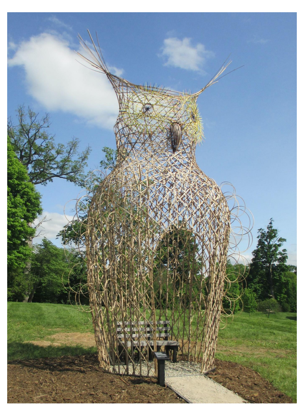
D. The Great Owl, 25 ft tall, Bamboo, wire ties and mixed media, 2022.