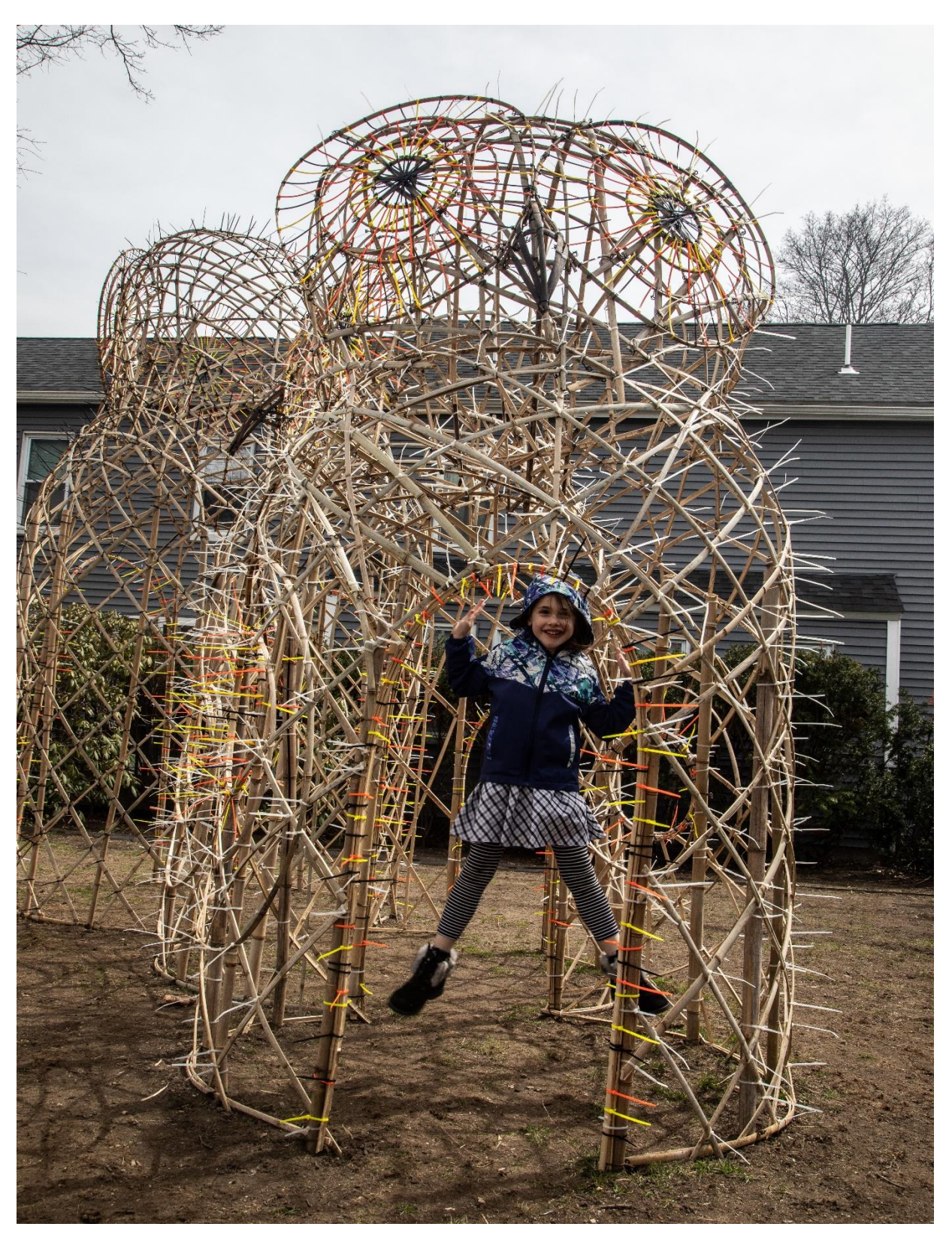
B. "The Power of Three: For the Love of Northern Saw Whet Owls, 20fthx15ftwx30ftl bamboo, mixed media, 2023