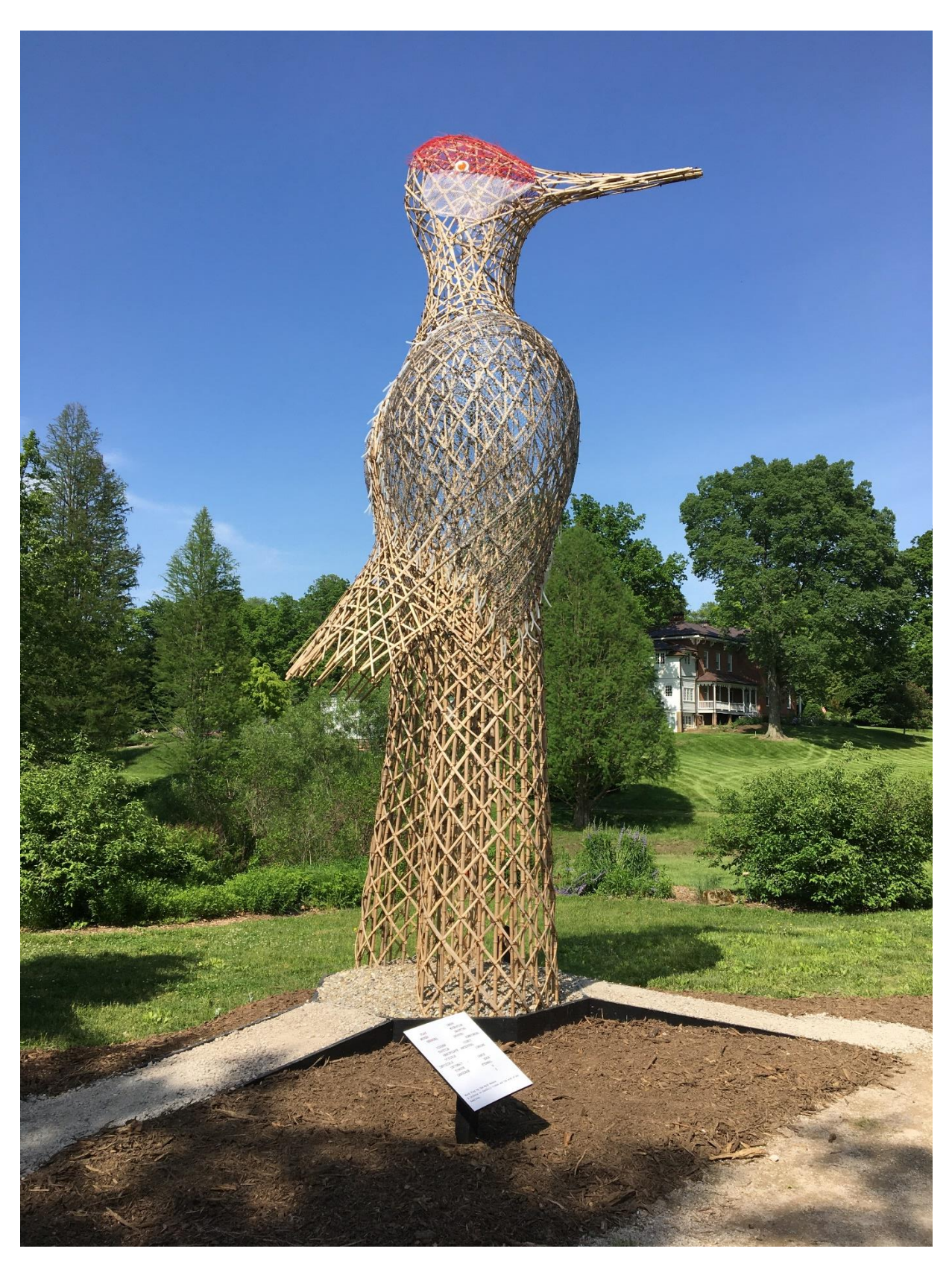
C. Towering, 30 ft tall, Bamboo, wire ties and mixed media, 2022.